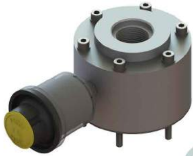
Flange LK 73mm DIN 24557

By using the pressure indicator clogging of a filter can be made visible. By increase of the differential pressure the pressure indicator shows from 80 mbar vacuum on that the filter unit needs to be serviced. The display can be reset by a click of the "Push to reset" button.